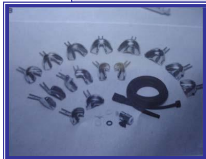
The special equipment and the water-cooled impression trays needed for the agar impression material.

-Irreversible hydrocolloids (alginate impression material)