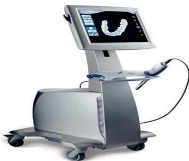
Chairside CAD-CAM unit.