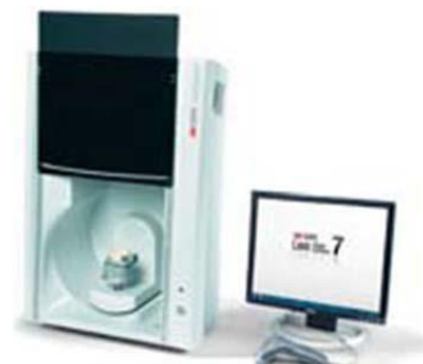
Laboratory CAD-CAM unit.